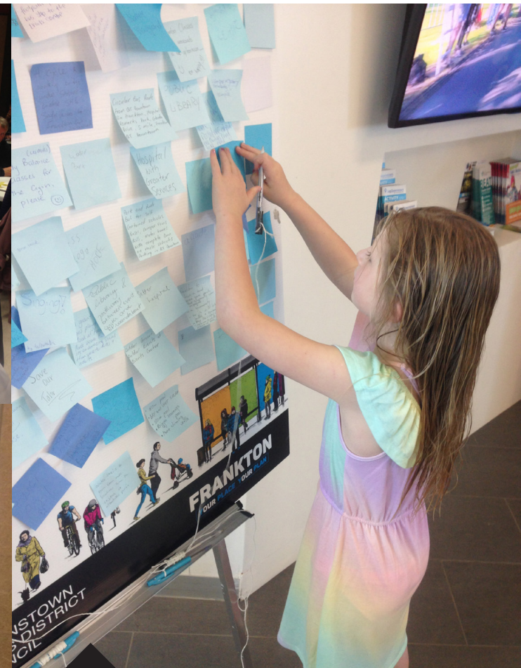
Have your say board at Queenstown Events Centre