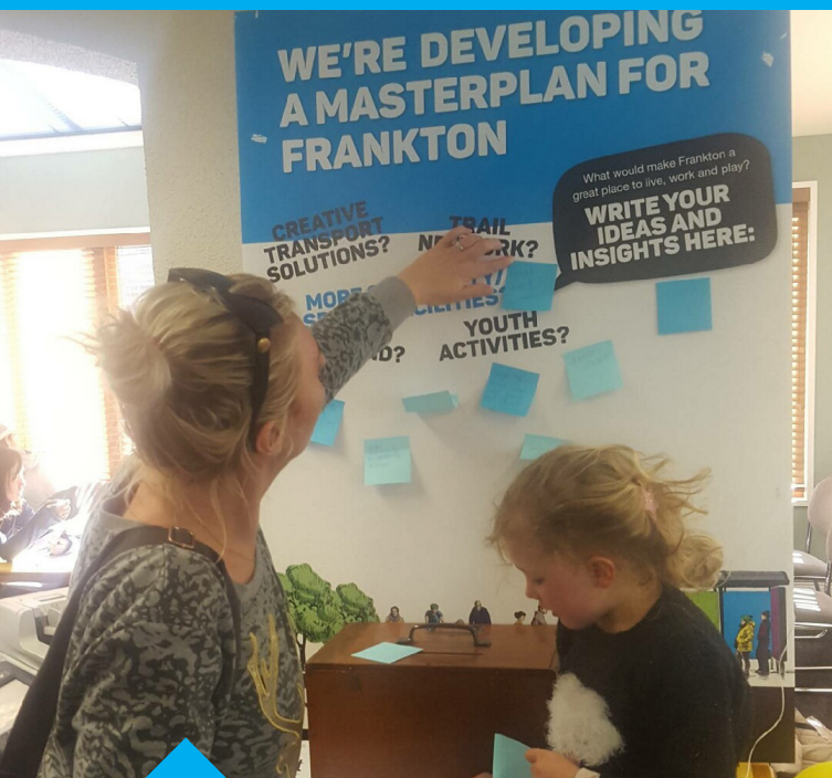
Have your say board at Queenstown Library