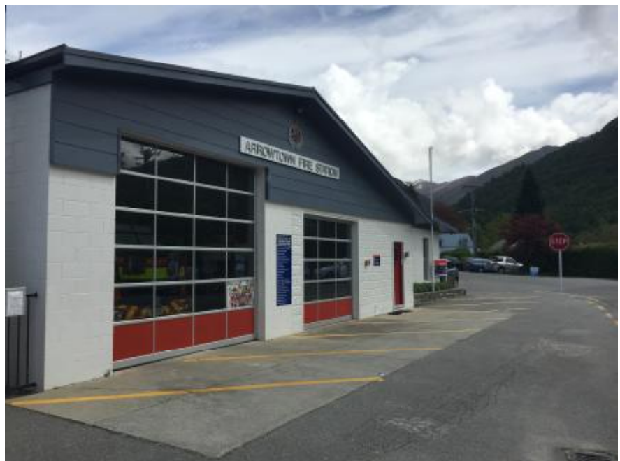
Photo 1: Arrowtown Fire Station (from Hertford Street looking north west towards Wiltshire Street)