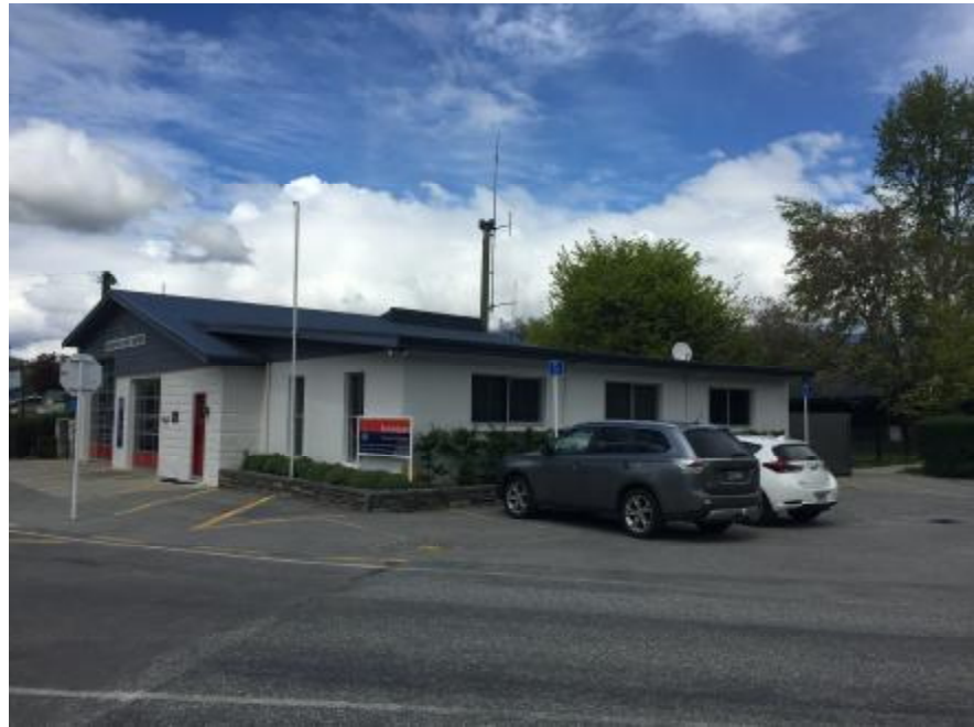
Photo 2: Arrowtown Fire Station (from Wiltshire Street looking south)