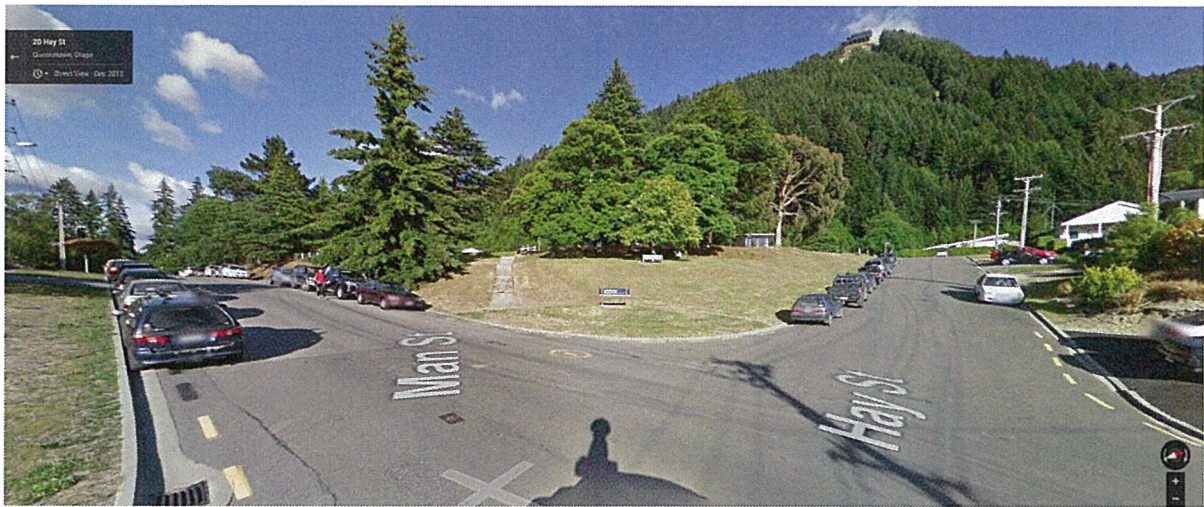
Figure A