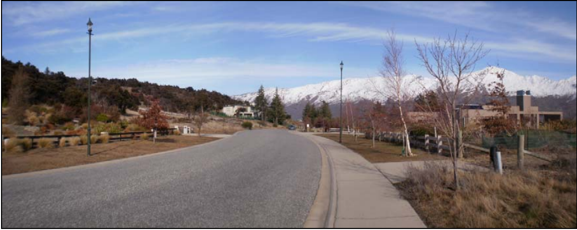
Figure 5: View from public walkway towards the lower part of the Special Zone and Penrith Park Drive