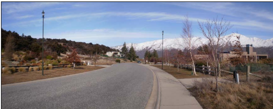
Figure 8: The natural form of the ridgeline to the left in this photograph has been retained

Of note is Site Standard 12.7.5.1 ii (d) and (e) which state (underlining added):