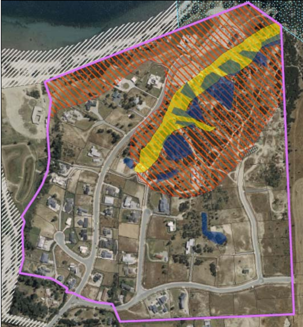
Figure 3: Penrith Park Special Zone overlaid on an aerial photograph taken in 2007.

Figure 3 below shows the zone boundaries overlaid on an aerial photograph: