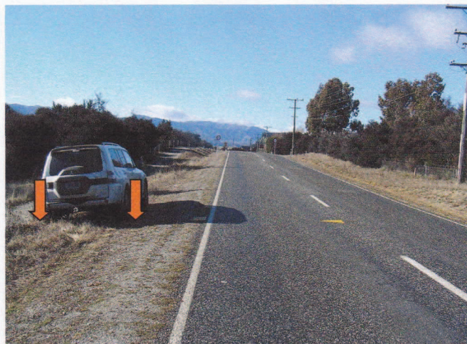
Map Location 3: Aubrey Road (QLDC Road) Looking towards Rockhaven Latitude (44° 40' 38" S) Longitude (169° 10' 22" E)