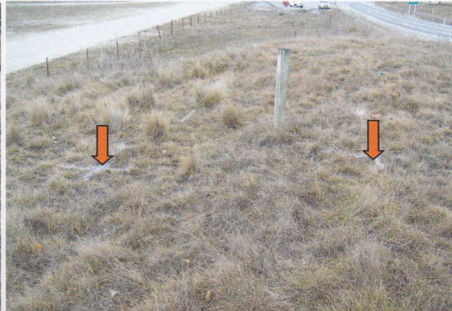
Map Location 2: SH 6 Hawea Side of the Clutha River Bridge Latitude : -44.67748 (44° 40' 38.92" S) Longitude : 169.19212 (169° 11' 31.65" E)