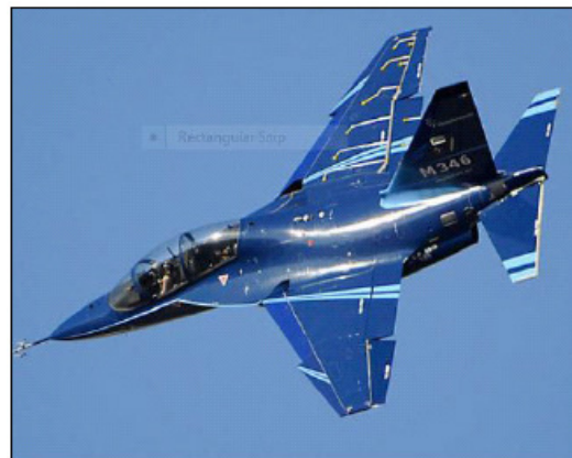
Figure 2: Aermacchi airplane of similar appearance.

The Aermacchi aircraft is similar in appearance to the plane shown in Figure 2 below: