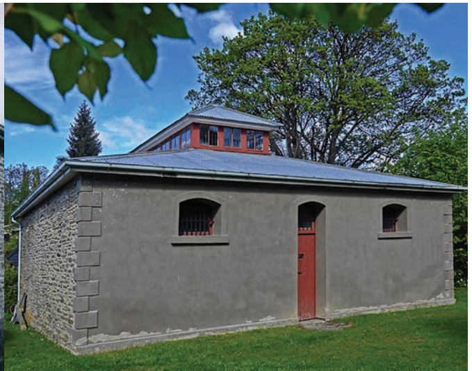
Arrowtown Gaol just prior to restoration work. Spring 2016.