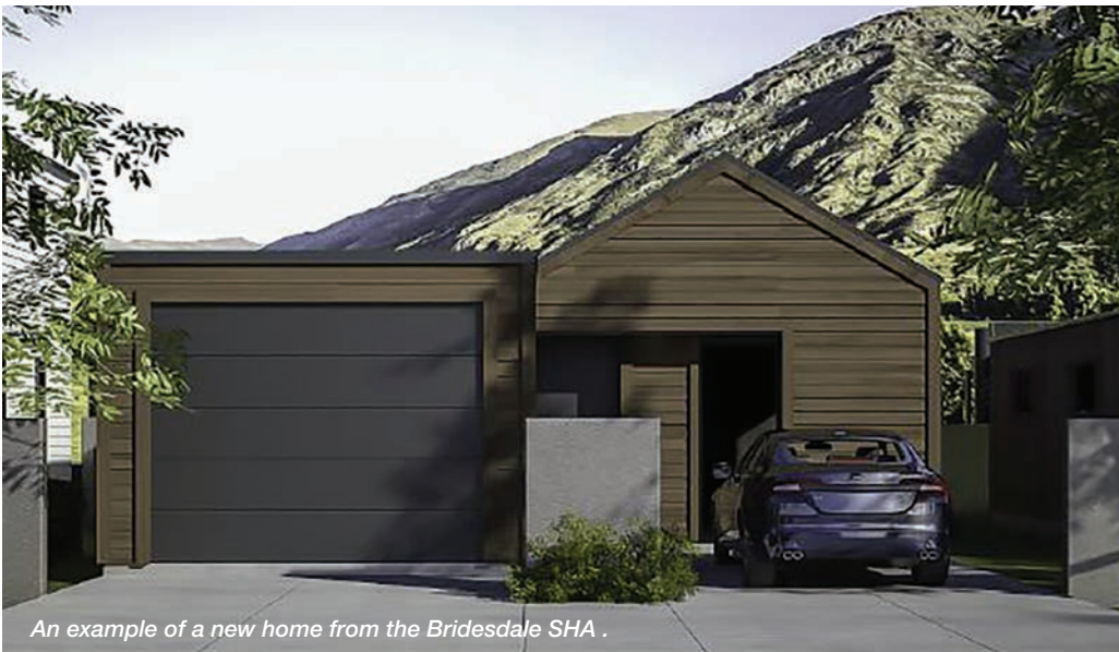
An example of a new home from the Bridesdale SHA.

Check online at www.qldc.govt.nz for the outcome of Council discussions for the potential development of Ladies Mile.