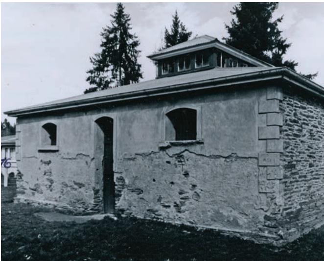
Arrowtown Gaol during the 1970s.

The gaol is now fit for purpose and this Category 1 Historic Places Trust listed building can be safely enjoyed by visitors for many years to come.